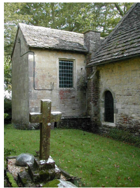
Top Left: Fifehead Church (south face) Lower: Newman chapel on north side