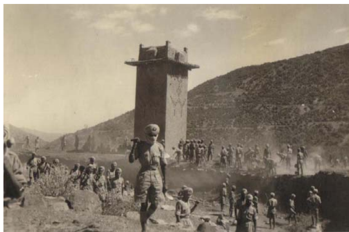
Waziristan tribal village demolition – 1937.

The destruction of his headquarters lowered the Faqir's prestige and ended the first phase of the operations. The firebrand of Ipi was temporarily a fugitive. The second phase, that of roadmaking, lasted without intermission until October 15th, 1937. There were occasional clashes with hostile gangs, but no organized resistance was encountered. On June 1st, the 1st Division relieved the Bannu and Razmak Brigades in the Sham Plain and the two brigades concentrated in the Razmak area. 2 Meanwhile, the Circular Road, which had been damaged between Dosalli and Razmak, had been re-opened by the combined efforts of the Sappers and Miners and the Military Engineer Services. The third and final phase of the operations took the form of an invasion of the Bhattani country further south by the 1st Division and more roadmaking by the Sappers and Miners and civilian labour in one of the most fantastically rugged regions on the North-West Frontier. This, briefly, was the general trend of events after the downfall of the notorious Faqir.