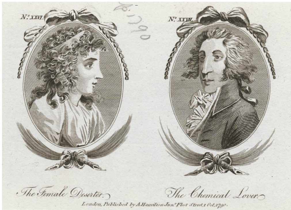
Caricatures of Lydia and Francis as published in Town and Country Magazine, Sept 1790