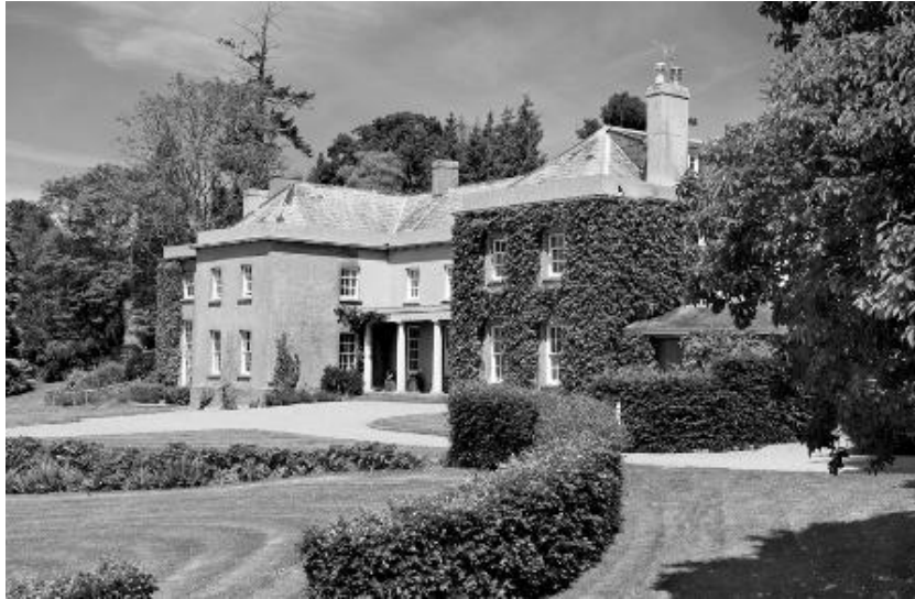
Fursdon House, Cadbury, Devon